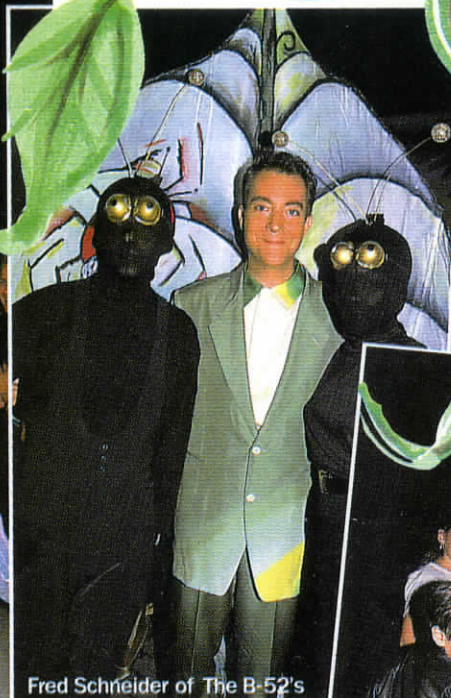
Fred Schneider of The B-52's