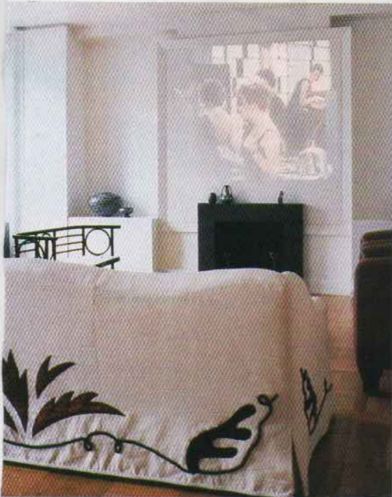
No screen is required with the projection TV system that features a frame devised by architect Shirley Chang. The white wall above the mantel does quite nicely.