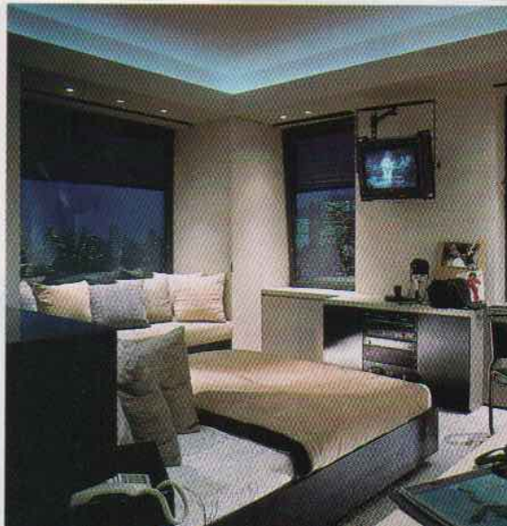
In a Manhattan high rise, architect R. Scott Bromley installed a swiveling wall-mounted armature to make sure that the TV was visible from any point in the master bedroom.

"My answer to the television set question is bury it! If you bury it in the backyard, turn the volume all the way up before shoveling in the topsoil"