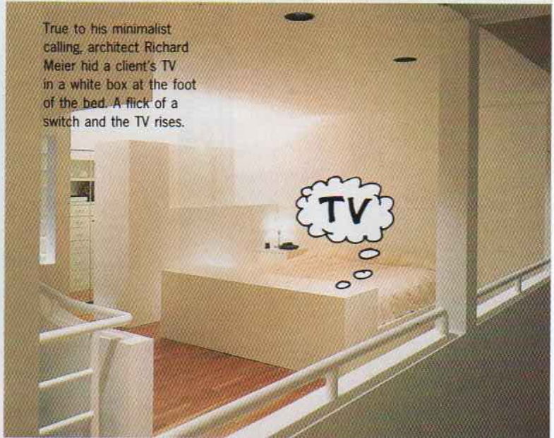
True to his minimalist calling, architect Richard Meier hid a client's TV in a white box at the foot of the bed. A flick of a switch and the TV rises.