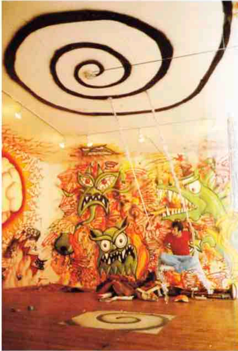
Figure 2. Kenny Scharf. P.S.1 Installation: Heaven and Hell , 1982. Installation in the Project Room, PS1, Long Island City NY. Private collection. © 2012 Kenny Scharf / Artists Rights Society (ARS), New York.