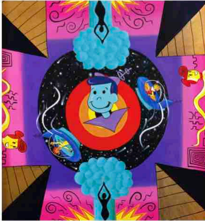
Figure 6. Kenny Scharf. Elroy Mandala II , 1982. Acrylic on canvas, 152.4 × 152.4 cm. Private collection. © 2012 Kenny Scharf / Artists Rights Society (ARS), New York.