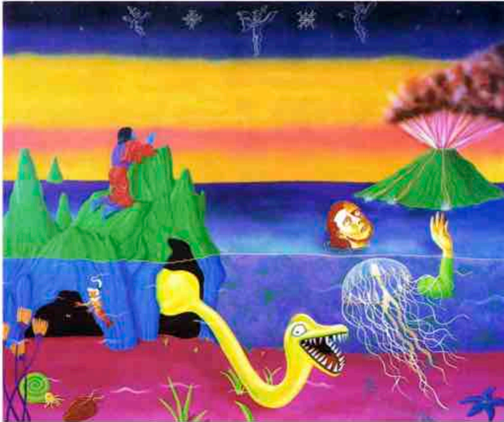
Figure 5. Kenny Scharf. In Ecstasy , 1982. Acrylic and spray paint on canvas, 227.3 × 273.1 cm. The Dannheiser Foundation. © 2012 Kenny Scharf / Artists Rights Society (ARS), New York.