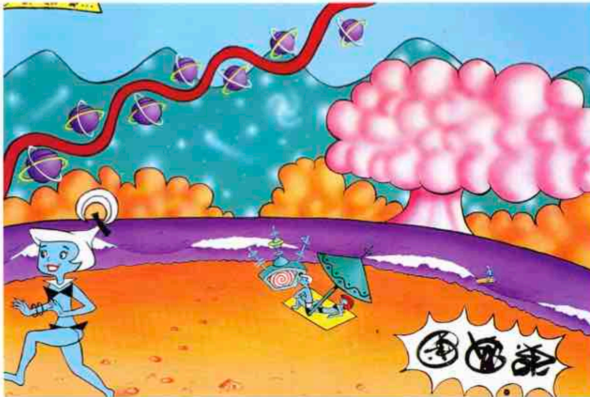
Figure 1. Kenny Scharf. Judy on the Beach , 1981. Acrylic on canvas, 50.8 × 76.2 cm. Private collection. © 2012 Kenny Scharf / Artists Rights Society (ARS), New York.