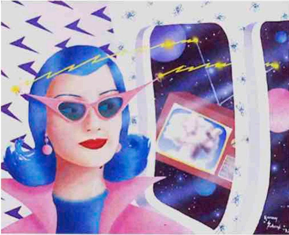
Figure 8. Kenny Scharf. Estelle 2: "Escape in Time," 1979. Acrylic on canvas, 45.7 × 55.9 cm. Private collection. © 2012 Kenny Scharf / Artists Rights Society (ARS), New York.