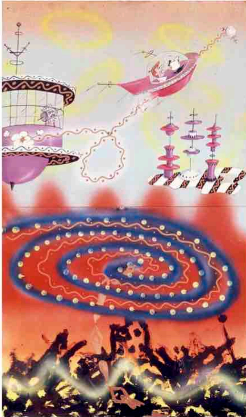
Figure 7. Kenny Scharf. Heaven and Hell I , 1981. Acrylic and spray paint on canvas, 71.1 × 55.9 cm. Private collection. © 2012 Kenny Scharf / Artists Rights Society (ARS), New York.