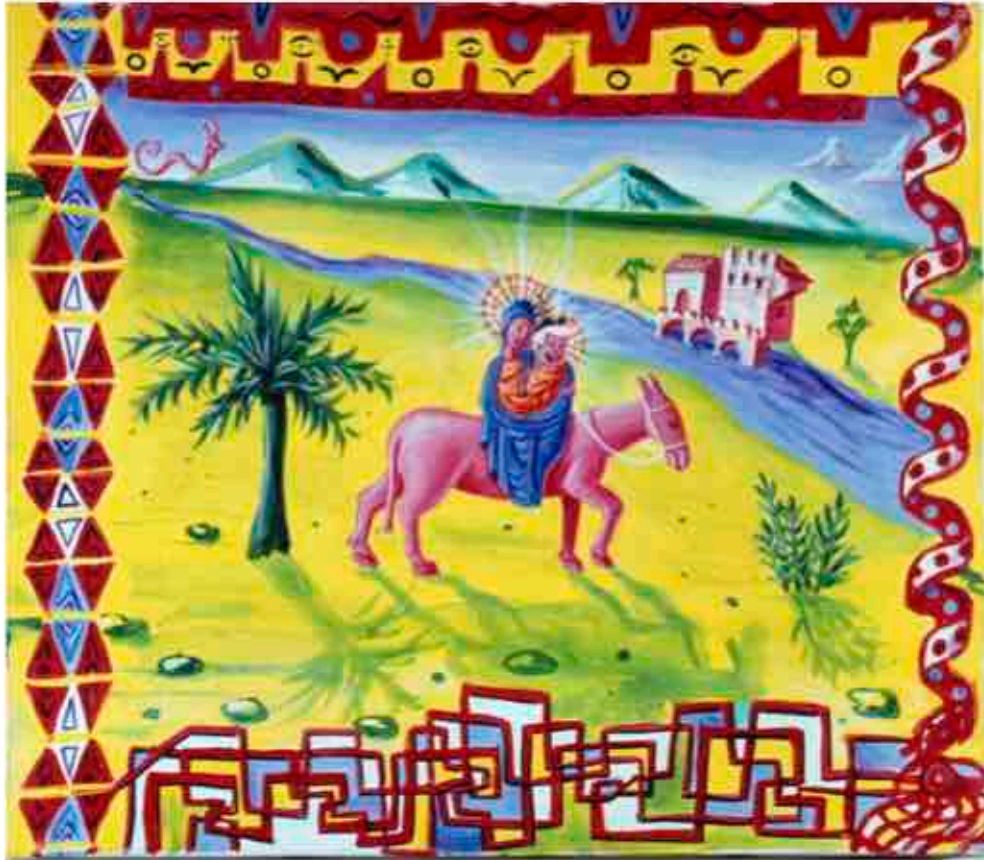
Figure 4. Kenny Scharf. Madonna e Bambino , 1981. Acrylic on canvas, 30.48 × 35.56 cm. Private collection. © 2012 Kenny Scharf / Artists Rights Society (ARS), New York.