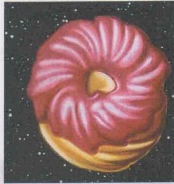
Left: Kenny Scharf – Cosmic White Frosted Donut, 1982. Oil on linen, 24 x 24 inches. Private Collection / Right: Kenny Scharf – Scharf, Pink Frosted Cruller in Outer Space, 2010. Oil on linen. Private Collection