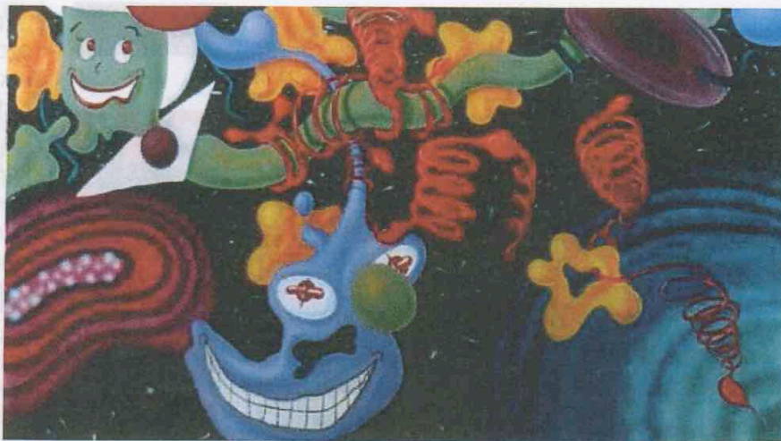
Kenny Scharf – Plasomospace, 1982. Oil and spray paint on canvas. 103 X 114 inches. Private Collection