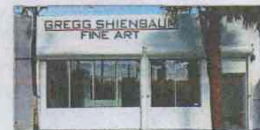
GREGG SHIENBAUM FINE ART MIAMI Miami, United States