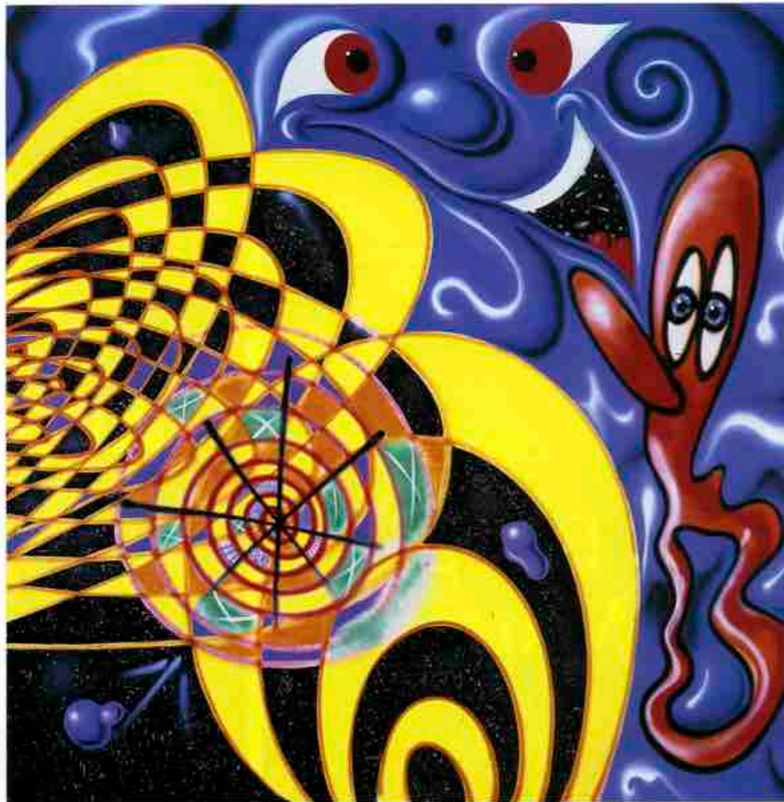
OP BOP 1985 Acrylic, oil and enamel spraypaint on canvas 87 by 89 1/2 inches