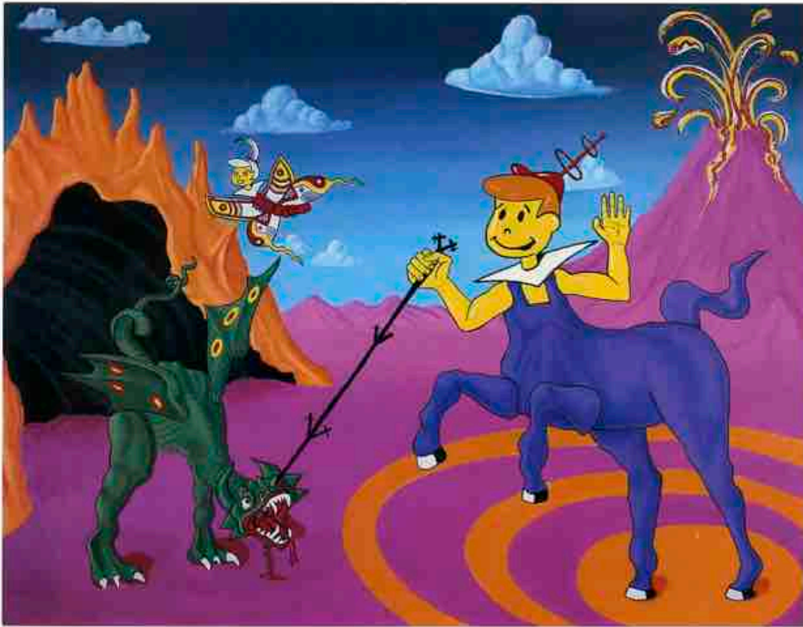
ST. ELROY SLAYING THE DRAGON 1982 Acrylic on canvas 48 by 62 inches