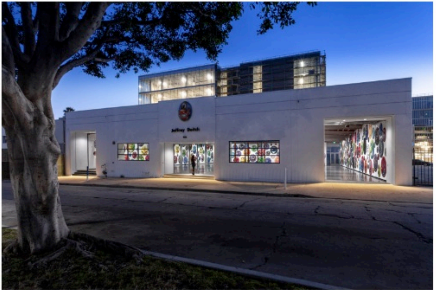
Installation view, "Kenny Scharf: MOODZ" at Jeffrey Deitch, Los Angeles.

Kenny Scharf, Monstrono (2020).