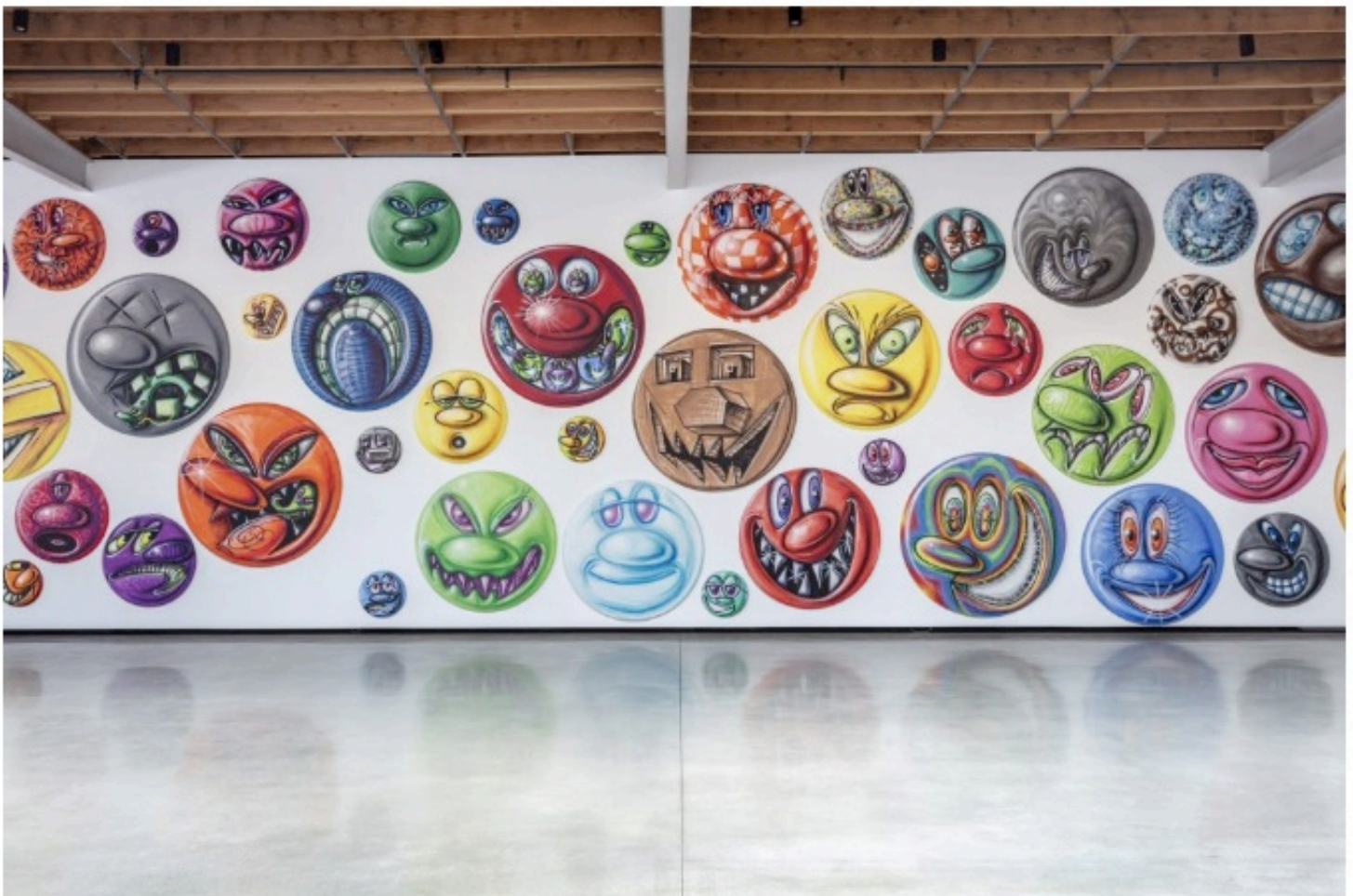
Installation view, "Kenny Scharf: MOODZ" at Jeffrey Deitch, Los Angeles.