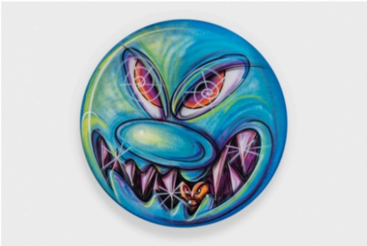
Kenny Scharf, Monstrono (2020).