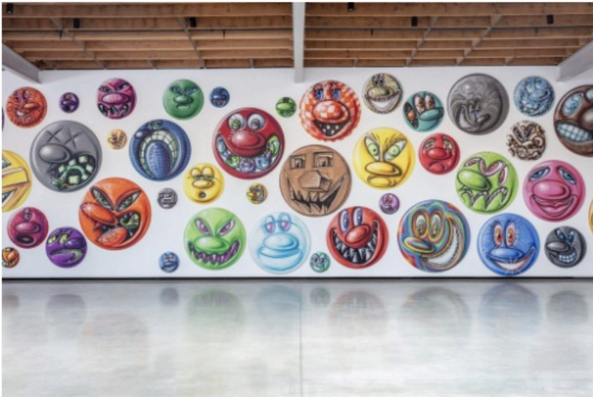
Installation view, "Kenny Scharf: MOODZ" at Jeffrey Deitch, Los Angeles.