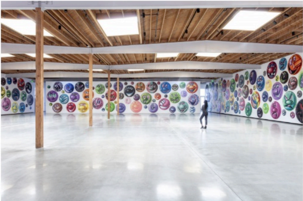
Installation view, "Kenny Scharf: MOODZ" at Jeffrey Deitch, Los Angeles.