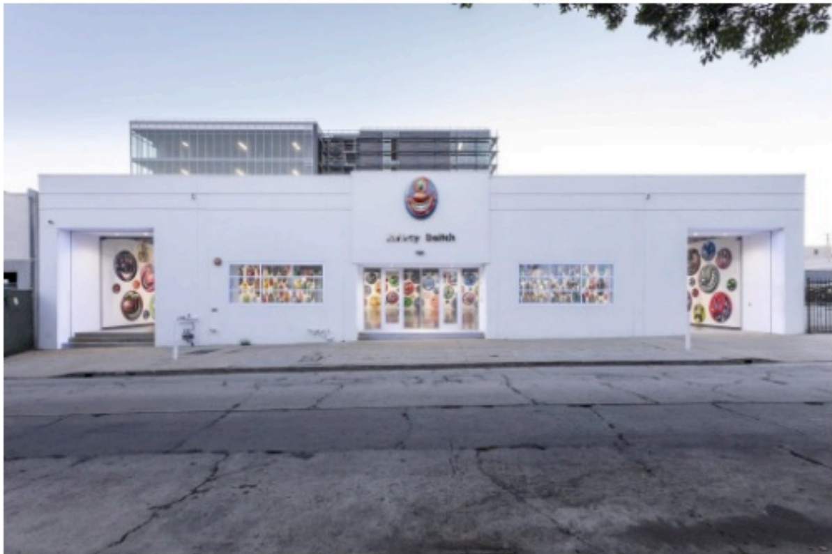
Installation view, "Kenny Scharf: MOODZ" at Jeffrey Deitch, Los Angeles.